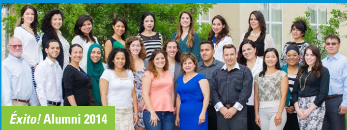
Éxito! Alumni 2014