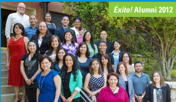
Éxito! Alumni 2012