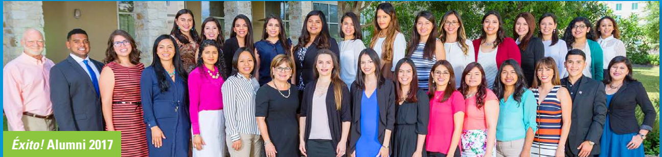
Éxito! Alumni 2017

See what alumni are saying about their experience during the Éxito! Summer Institute.