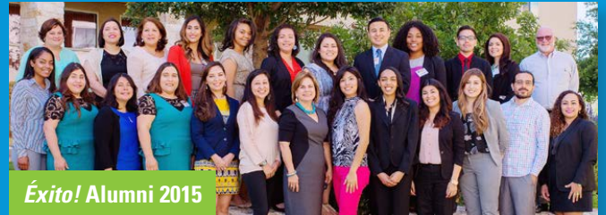
Éxito! Alumni 2015