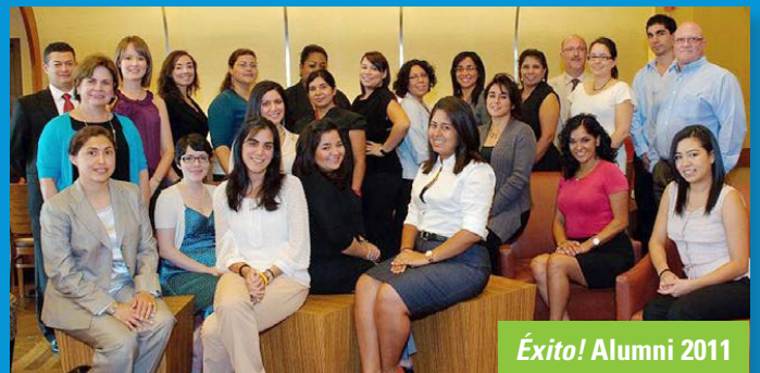
Éxito! Alumni 2011