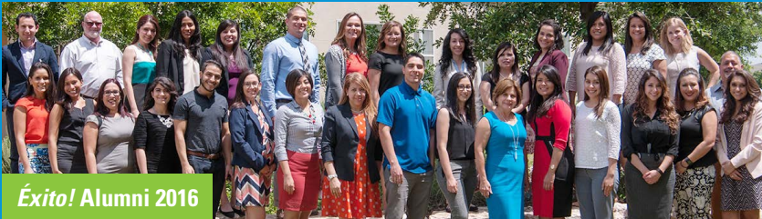
Éxito! Alumni 2016