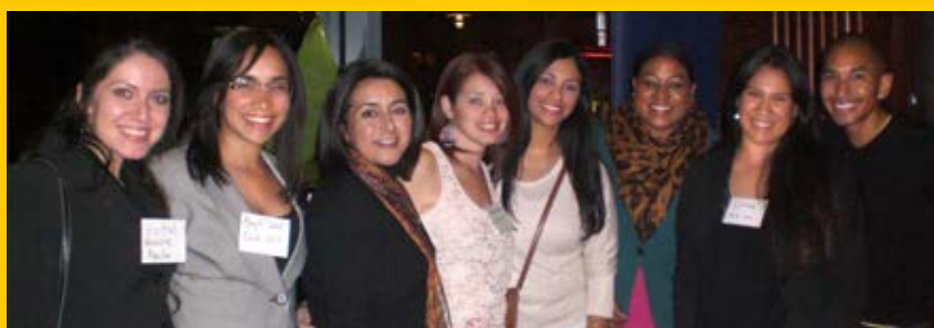
Éxito! Alumni, APHA Alumni Dinner, 2012, San Francisco, CA