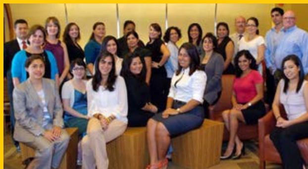
Éxito! Alumni 2011