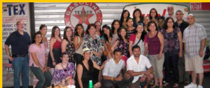
Éxito! 2012, Texas Pride BBQ, San Antonio, TX