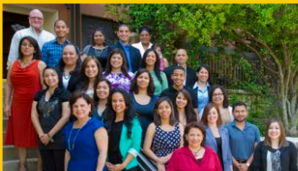
Éxito! Alumni 2012

See what 2012 alumni are saying about their experience during the Éxito! Summer Institute.