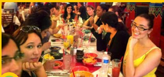
6 Éxito! 2011, Mi Tierra Restaurant, San Antonio, TX