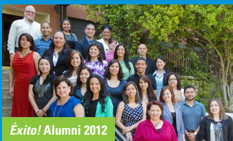
Éxito! Alumni 2012