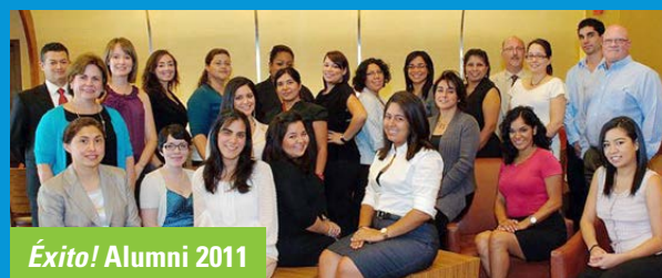
Éxito! Alumni 2011