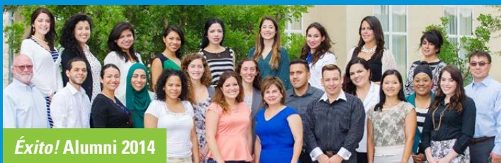
Éxito! Alumni 2014