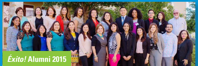
Éxito! Alumni 2015