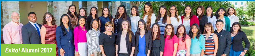
Éxito! Alumni 2017