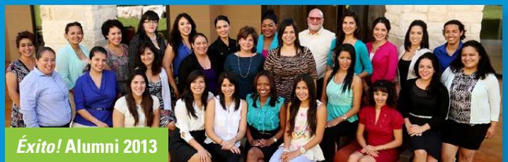
Éxito! Alumni 2013