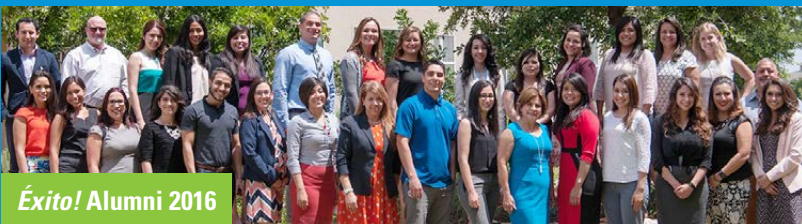
Éxito! Alumni 2016