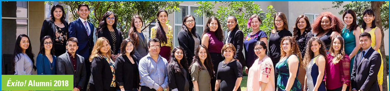
Éxito! Alumni 2018

See what alumni are saying about their experience during the Éxito! Summer Institute.